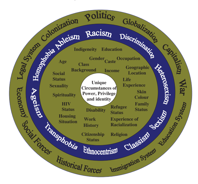
Figure 1 Intersectionality wheel (Simpson, 2009).

Before reviewing the 10 best resources we recommend, we discuss here our process for identifying and selecting these resources. We started with a preliminary review of articles using intersectionality in public health. After experimenting with a range of terms in Pubmed ('Intersectionality', 'Intersectionality LMIC', 'Intersect* LMIC', 'Intersectionality Health' and 'Intersections Health'), the